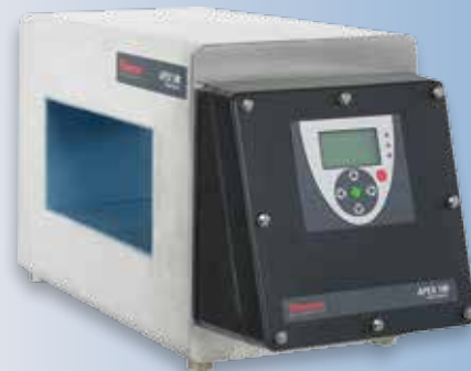
Thermo Scientific APEX 100 Metal Detector